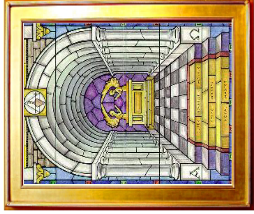
Chicago Council No. 4 Cryptic Masons Chartered September 26, 1855

Royal Arch Masonry provides an opportunity for Master Masons desirous of further light to explore some of the deeper mysteries of the Craft. The four degrees of the Chapter, in which candidates take an active part, are truly some of the most profound and impressive in Freemasonry. In the Royal Arch Degree itself, the Lost Word of a Master Mason is rediscovered in a beautiful ceremony that takes the candidates through the destruction of King Solomon's Temple, the seventy years of the Babylonian captivity, and the ultimate return to the Holy Land to aid and assist in the rebuilding of the Temple of the Most High. No other degrees are so intimately linked with the Blue Lodge or have so ancient and noble a history.