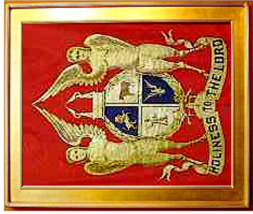
La Fayette Chapter No. 2 Royal Arch Masons Constituted July 12, 1844